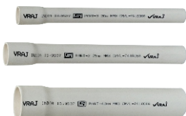
Vraj Rigid uPVC Conduit Pipe Socketed