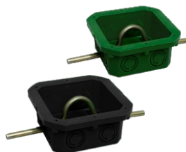
Vraj Fan Box with Hook