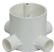
Vraj Rigid uPVC Moulded Junction Box - Deep