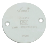
Vraj Rigid Circular LID & Screw