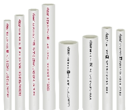
Vraj Rigid uPVC Conduit Pipe Plain