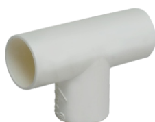
Vraj Rigid uPVC Conduit Pipe's Tee