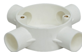
Vraj Rigid uPVC Moulded Junction Box - Normal