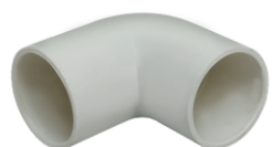
Vraj Rigid uPVC Conduit Pipe's Elbow