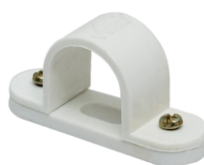
Vraj Rigid uPVC Conduit Pipe's Saddle Set